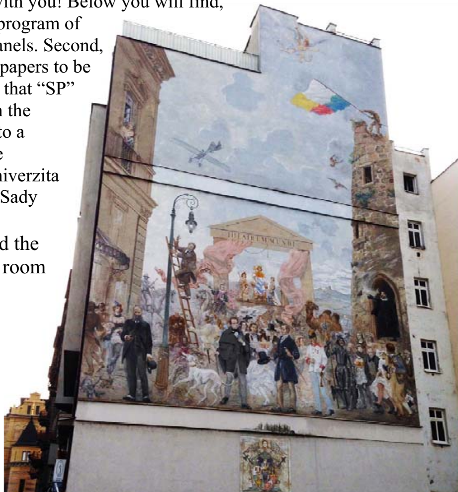
Theatro Mundi depicting famous citizens of Plzeň